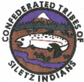
CONFEDERATED TRIBES OF SILETZ INDIANS