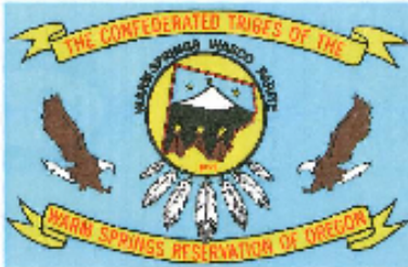
CONFEDERATED TRIBES OF WARM SPRINGS RESERVATION