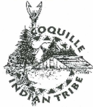
COQUILLE INDIAN TRIBE